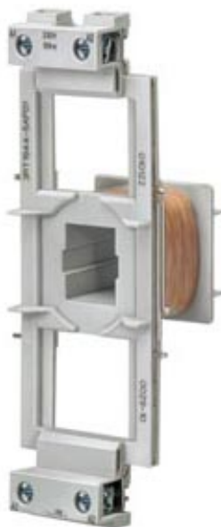
MAGNET COIL F. CONTACTORS SIRIUS, MOD.S3, CAGE-CLAMP CONNECTION AC 100 V, 50 HZ/100...110V,60HZ