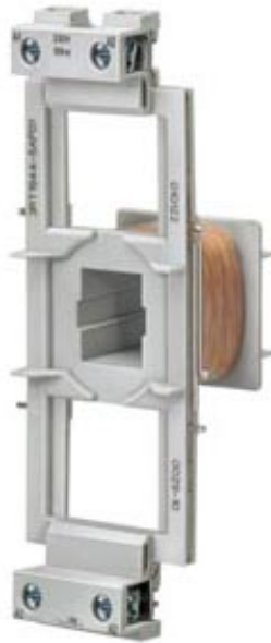
COIL FOR CONTACTORS SIRIUS, SIZE S3, SCREW CONNECTION, AC 400 V, 50 HZ