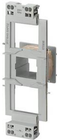
COIL FOR CONTACTORS SIRIUS, SIZE S3, CAGE-CLAMP CONNECTION AC 110 V, 50 HZ