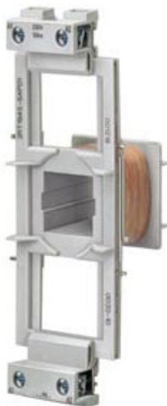
MAGNET COIL F. CONTACTORS SIRIUS, MOD.S3, SCREW-TYPE CONNECT., AC 100 V, 50 HZ/100...110V,60HZ