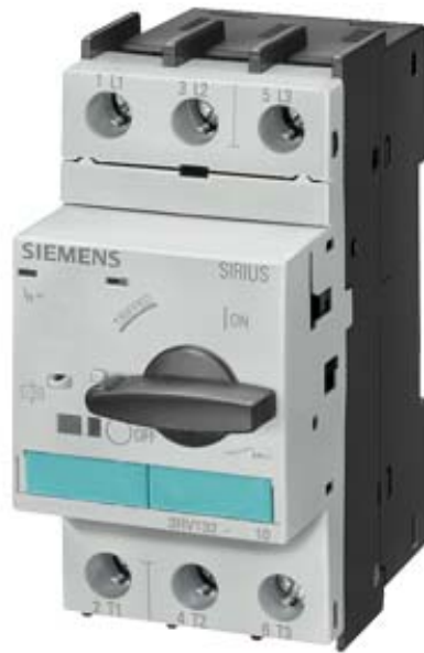
CIRCUIT-BREAKER N-RELEASE 42 A, SIZE S0 STARTER PROTECTION, 100 KA SCREW CONNECTION