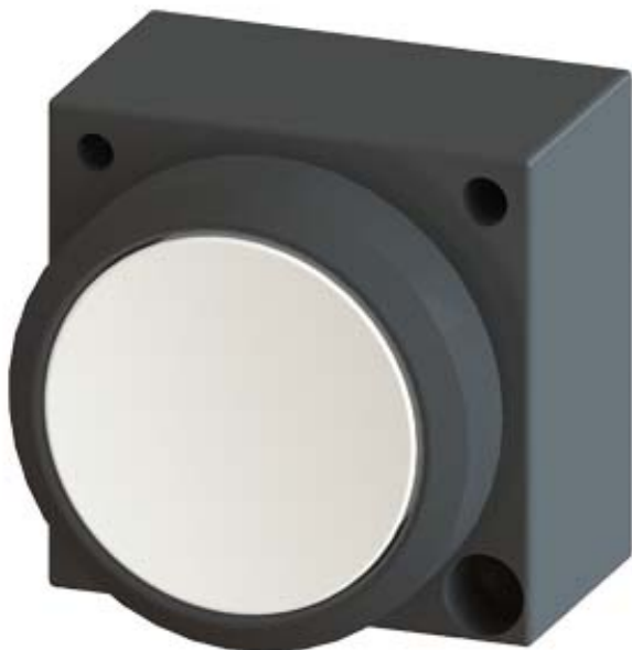
22MM PLASTIC ROUND ACTUATOR: PUSHBUTTON WITH FLAT BUTTON WITH HOLDER WHITE