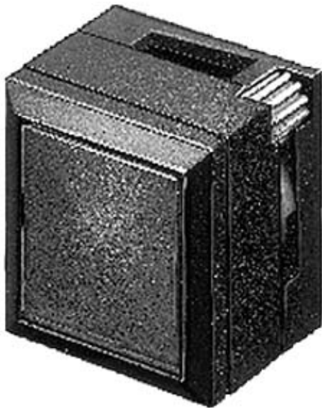
26X26MM PLASTIC SQUARE ACTUATOR: TOGGLE CATCHING 3 SWITCH POSITIONS I-O-II ILLUMINATED WITH HOLDER RED