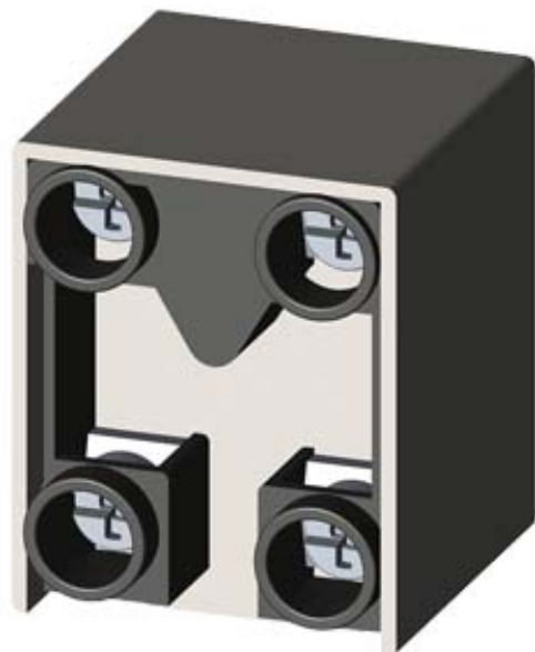
CONTACT BLOCK IP20 FOR POSITION SWITCH 3SE5250 OPEN-TYPE DESIGN 1NO/1NC SLOW-ACTION CONTACT