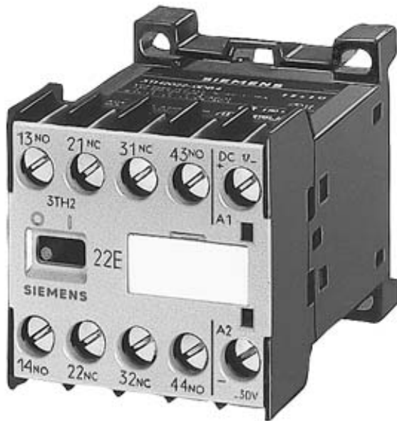
CONTACTOR RELAY 22E EN 50 011 2NO+2NC, SCREW TERMINALS DC OPERATION DC SOLENOID SYSTEM DC 24V