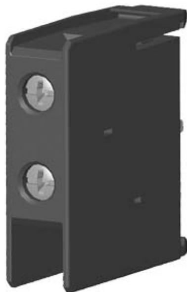
ACCESSORY FOR VT250, VT630 AUX. SWITCH 1CO 60 - 250V AC/DC