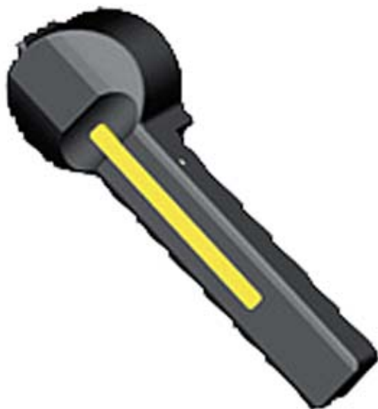
ACCESSORY FOR VT1000, VT1600 ACTUATOR WITHOUT PLUG BLACK