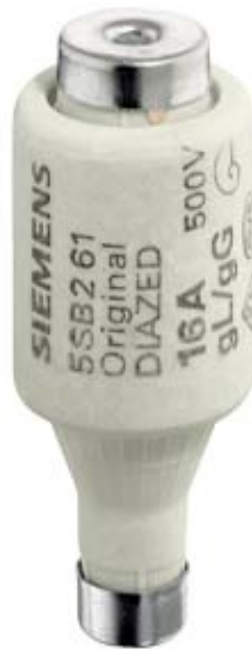
DIAZED FUSE LINK 500V F.CABLE AND LINE PROTECTION OP.CL.GL,SZ.DII,THREAD E27,16A