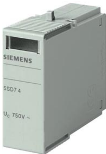
PROTECTION PLUG TYPE2 UC 750V AC, FOR 5SD7481-1 AND 5SD7483-5,