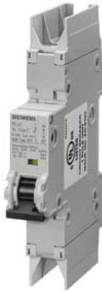
CIRCUIT BREAKER 10KA, 1POLE, D, 3A ACC. TO UL 489 - 277V