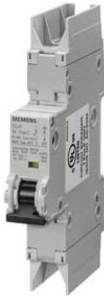
CIRCUIT BREAKER 10KA, 1POLE, D, 5A ACC. TO UL 489 - 277V