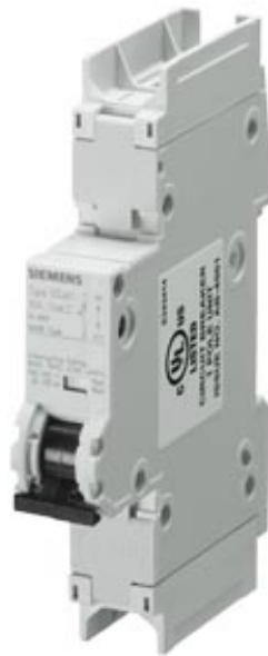
CIRCUIT BREAKER 240V 14KA, 1-POLE, D, 13A, D=70MM ACC. TO UL 489