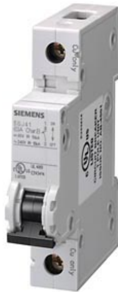
CIRCUIT BREAKER 240V 14KA, 1-POLE, D, 0,3A, D=70MM ACC. TO UL 489, SAME POLARITY