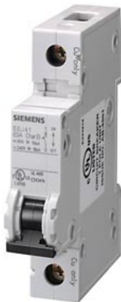
CIRCUIT BREAKER 240V 14KA, 1-POLE, D, 1,6A, D=70MM ACC. TO UL 489, SAME POLARITY