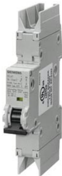
CIRCUIT BREAKER 10KA, 1POLE, D, 16A ACC. TO UL 489 - 277V