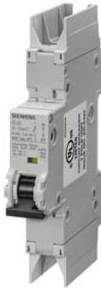
CIRCUIT BREAKER 10KA, 1POLE, D, 15A ACC. TO UL 489 - 277V