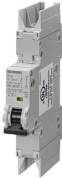
CIRCUIT BREAKER 10KA, 1POLE, D, 32A ACC. TO UL 489 - 277V