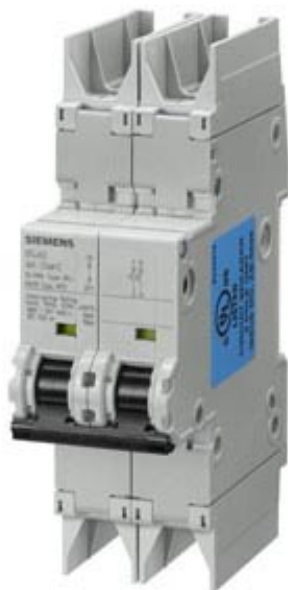
CIRCUIT BREAKER 10KA, 2POLE, D, 20A ACC. TO UL 489 - 480Y/277V