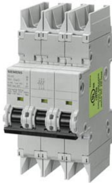
CIRCUIT BREAKER 10KA, 3POLE, D, 1A ACC. TO UL 489 - 480Y/277V