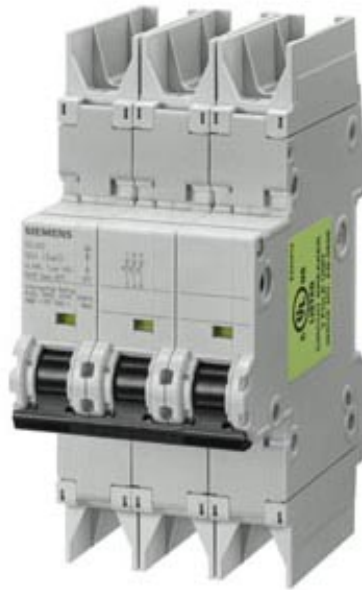
CIRCUIT BREAKER 10KA, 3POLE, D, 4A ACC. TO UL 489 - 480Y/277V