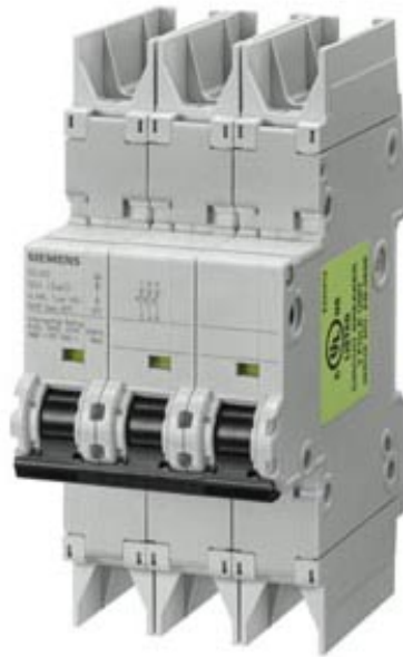
CIRCUIT BREAKER 10KA, 3POLE, D, 6A ACC. TO UL 489 - 480Y/277V