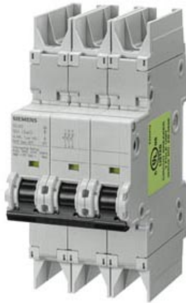
CIRCUIT BREAKER 10KA, 3POLE, C, 15A ACC. TO UL 489 - 480Y/277V