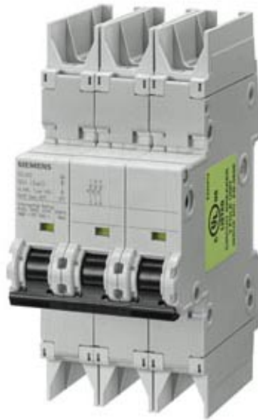
CIRCUIT BREAKER 10KA, 3POLE, D, 32A ACC. TO UL 489 - 480Y/277V