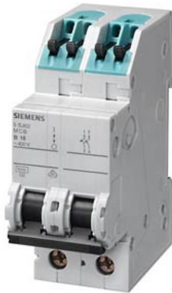
CIRCUIT BREAKER 400V 6KA, 2-POLE, B, 20A, D=70MM WITH SCREWLESS TAP-OFF TERMINAL