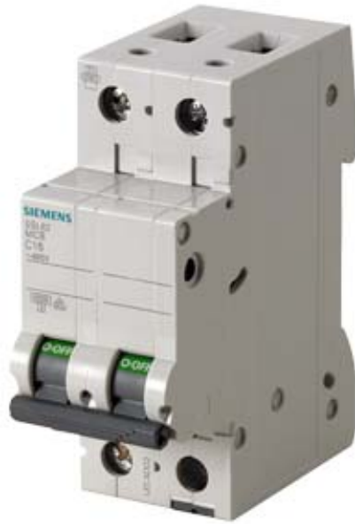
CIRCUIT BREAKER 230V 6KA, 1+N-POLE, B, 32A