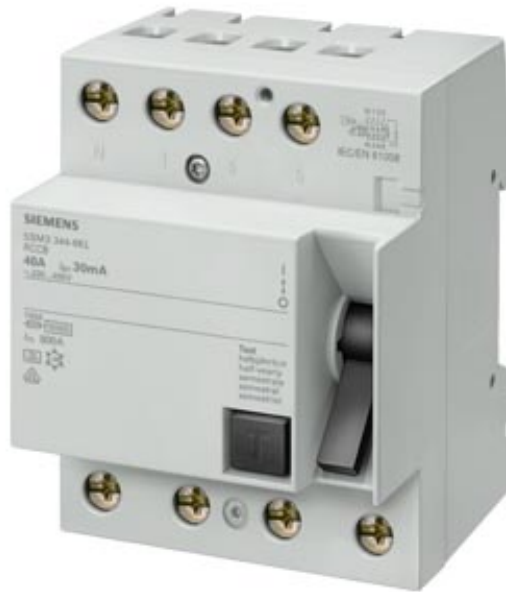
RES.CURRENT OP.CIRCUIT BREAKER TYPE A PSE/SSF, N-LEFT 80A 3+N-POL IFN 30MA 400V 4MW