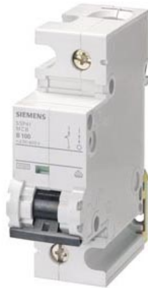
CIRCUIT BREAKER 230/400V 10KA, 1-POLE, B, 125A, D=70MM