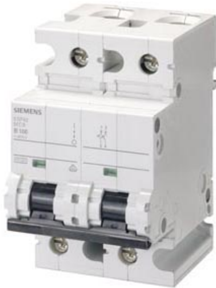
CIRCUIT BREAKER 400V 10KA, 2-POLE, B, 100A, D=70MM