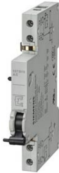
AUXILIARY SWITCH MOUNT. 1S+1OE, F. LS-SWITCH T=70MM