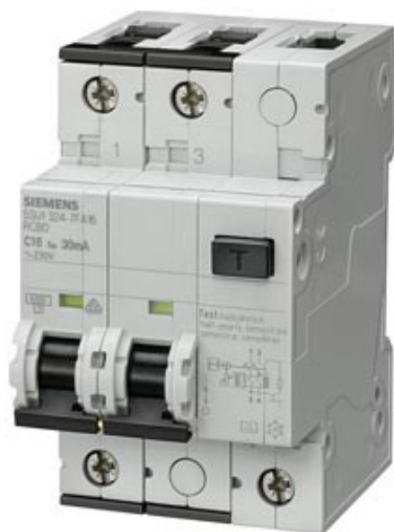
FI/LS-PROTECTOR TYPE A (PSE/SSF), D=70 MM IFN 30MA, 10KA,2-POLEE B 6A 3MW