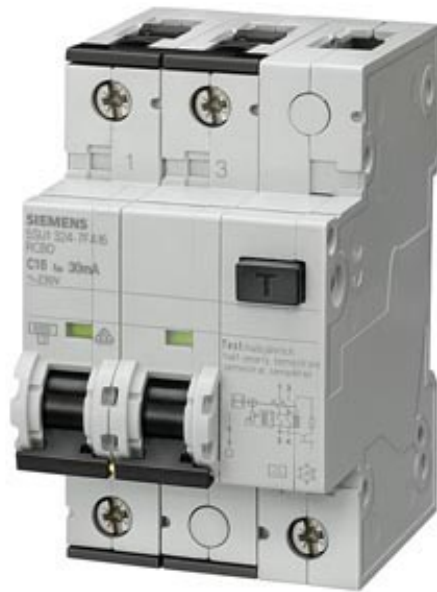
FI/LS-PROTECTOR TYPE A (PSE/SSF), D=70 MM IFN 30MA, 10KA,2-POLE B 20A 3MW