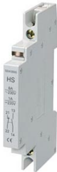
AUXILIARY SWITCH ATTACHABLE F. RES.CUR OP.CIRCUIT BR. 5SM1 T=55MM, 1NO+1NC