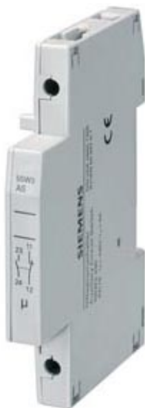
AUXILIARY SWITCH ATTACHABLE F. RES.CURRENT OP.CIRC. BREAKER F. 100+125A, 1NO+1NC