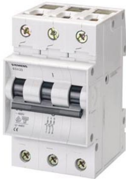
CIRCUIT BREAKER T55 400V, 6KA, 3-POLE, C, 16A