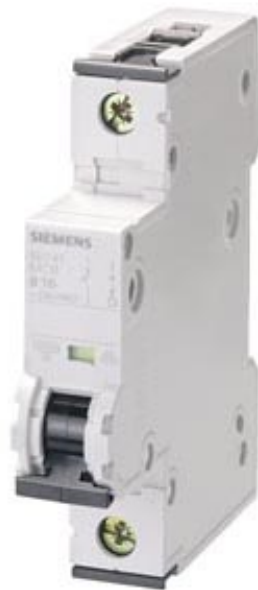
CIRCUIT BREAKER 230/400V 10KA, 1-POLE, C, 45A, D=70MM