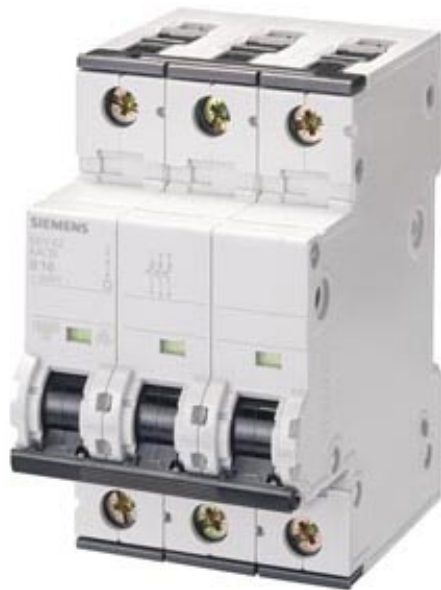
CIRCUIT BREAKER 400V 10KA, 3-POLE, C, 30A, D=70MM