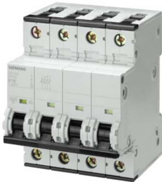
MINIATURE CIRCUIT-BR. 400V 10KA, 4-POLE, C, 0.3A FOR RAILWAY APPLICATIONS