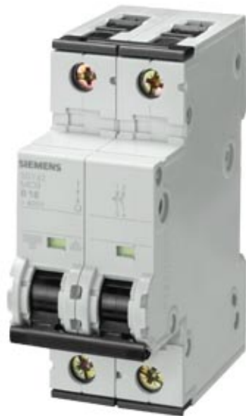
CIRCUIT BREAKER 400V 6KA, 2-POLE, C, 6A, D=70MM