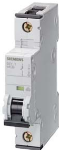
CIRCUIT BREAKER 230/400V 15KA, 1-POLE, B, 16A, D=70MM