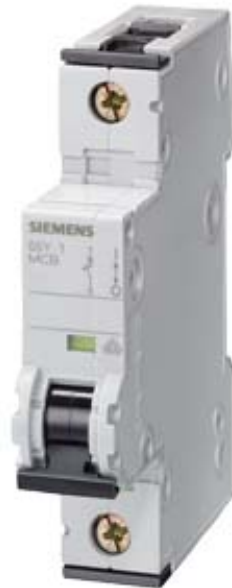
CIRCUIT BREAKER 230/400V 25KA, 1POLE, D, 6A, D=70MM