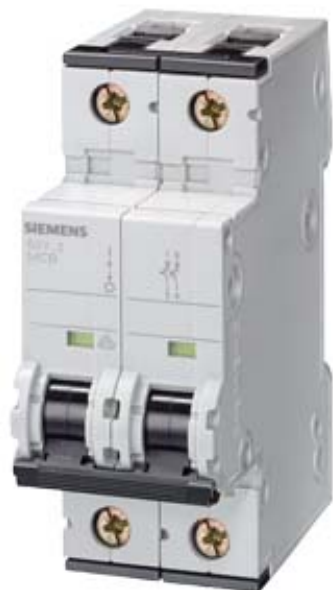
CIRCUIT BREAKER 400V 25KA, 2POLE, D, 25A, D=70MM