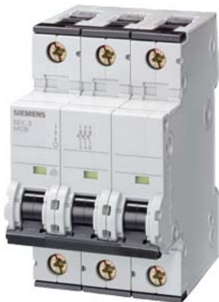
CIRCUIT BREAKER 400V 25KA, 3POLE, D, 4A, D=70MM