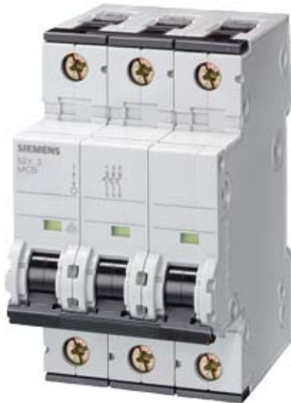
CIRCUIT BREAKER 400V 25KA, 3POLE, C, 63A, D=70MM