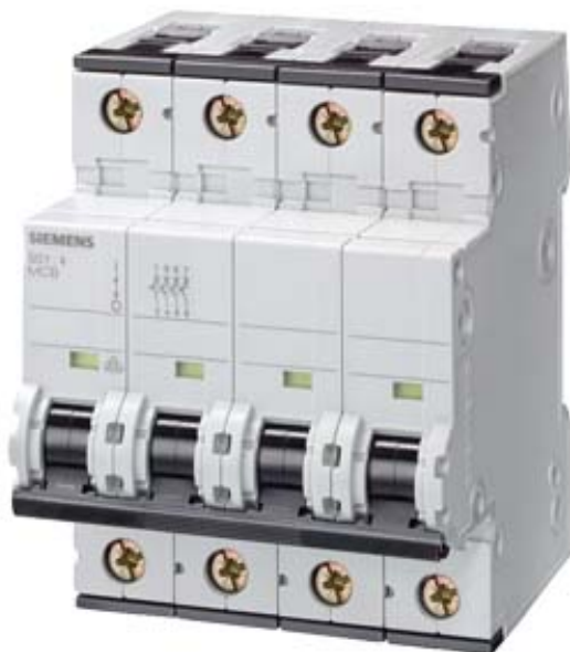
CIRCUIT BREAKER 400V 25KA, 3+N-POLE, D, 32A, D=70M