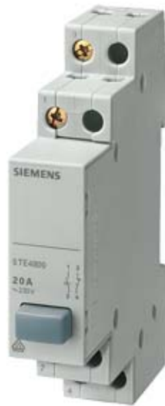
PUSHBUTTON, 1NO/1NC 20 A 1 BUTTON BLUE WITHOUT LATCHING FUNCTION