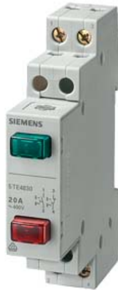
PUSHBUTTON, D=70MM 1NC/1NO 1NC/1NO 20A 2BUTTON RED+GREEN